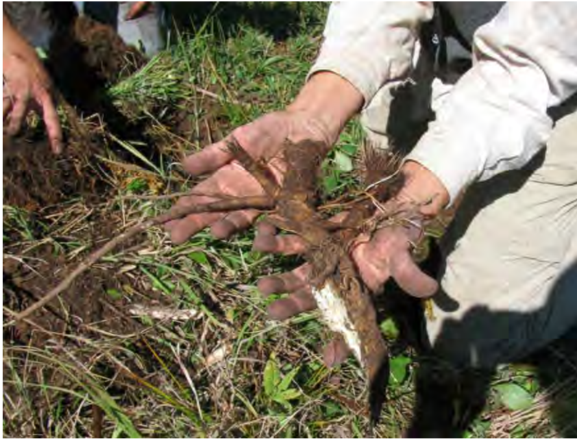
Figure 6: An osha root harvested from the Meadow site.

Not only did the Meadow versus Forested plot comparison show differences in the counts and cover of osha, we also found differences in the root weights in the two distinct habitats. In total, there were 1,181 mature plants (which includes both flowering and non-flowering mature plants) present from all plots in the two study sites combined. There were 15% more plants growing in the Meadow site than in the Forested site, and we were able to harvest 58% more total kg of root mass from the Meadow site than from the Forested site (Table 6). Additionally, the average weight of each individual root in the Meadow was more than double the weight of those found in the Forest (see root from a mature plant in Figure 6).