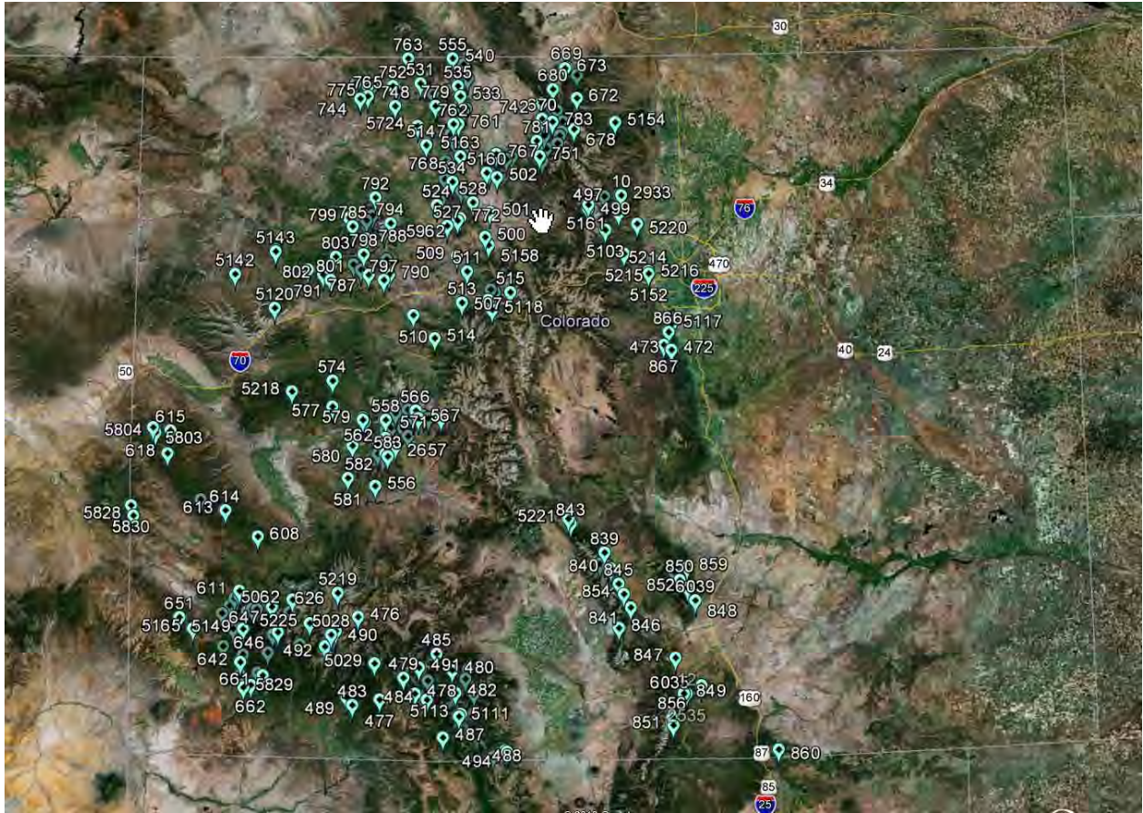
Figure 1: Locations of herbarium specimens for osha, Ligusticum porteri in Colorado. This map shows the distributions of osha are only in mountainous habitat. Our data were mapped using Google Earth.