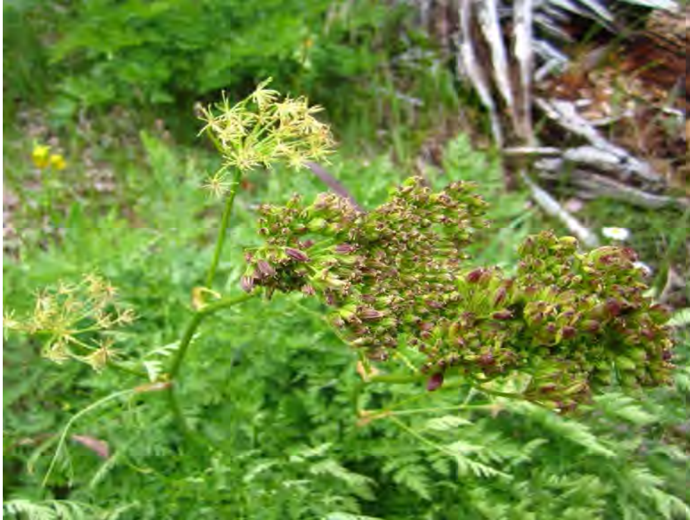
Figure 8: Osha produces a large number of seeds from its flowering umbels.

Our specific data indicate a return of 465 lbs of dried root weight per acre of dense stands in open canopy sites. At an average market price of $55/lb, one acre of osha could be worth over $25,575 in returns, highlighting the strong financial incentive for wildcrafting osha. However, based on our preliminary data we cannot make any statement at this time regarding whether current harvest rates can be considered unsustainable or whether the population is being threatened by overharvest.