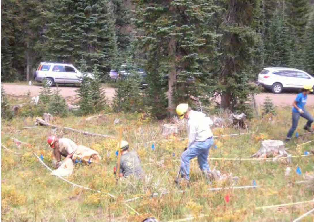
Figure 4: Digging within Meadow plots, temporarily delineated with meter tapes.