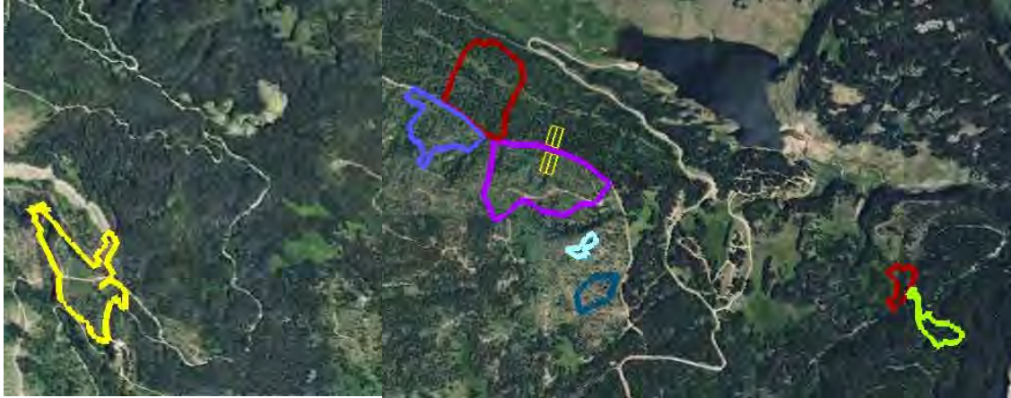
Figure 2: Outlines of 8 polygons or stands of osha populations for which osha cover data was collected. Note: in the center of the map, the 2 yellow double-rectangles designate the area of our sustainability of harvest study.

Additionally, the U.S. Forest Service asked us to work with the local Hispanic community to improve awareness of osha harvest and conservation. Ten Hispanic high school age youth from Costilla County’s Semillas Sembrados program in San Luis, Colorado joined us in mapping the boundaries of our stands. They were very enthusiastic about the opportunity to contribute to our research, and for many of the students this was their first exposure to scientific research.