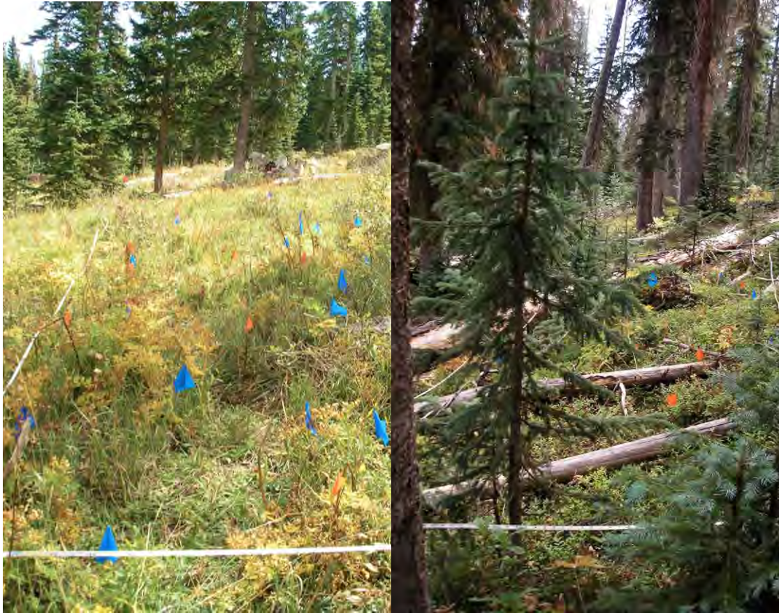
Figure 3: Comparison of a Meadow vs. Forested plot.

Within each plot we recorded counts and cumulative percent cover for specific size classes of osha: seedlings, juveniles, mature non-reproductive, and mature reproductive, as well as the number of flowering stalks. To examine the effect of light availability on osha population density and post-harvest regeneration, we measured canopy openness within each plot using a spherical densiometer. Plots with fewer than 6 mature plants were considered null and omitted from the study because it would be difficult to discriminate differences in harvest intensity in such low density plots. There were 14 plots in total that were considered null and therefore not used in our experiment.